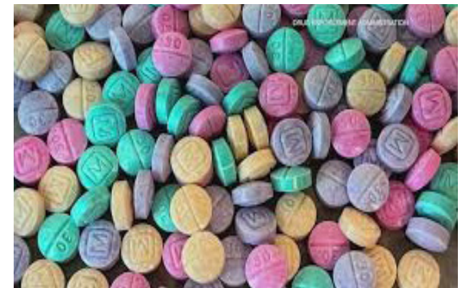
U.S. drug enforcement Agency

to ensure that these disguised drugs don't harm people unknowingly.