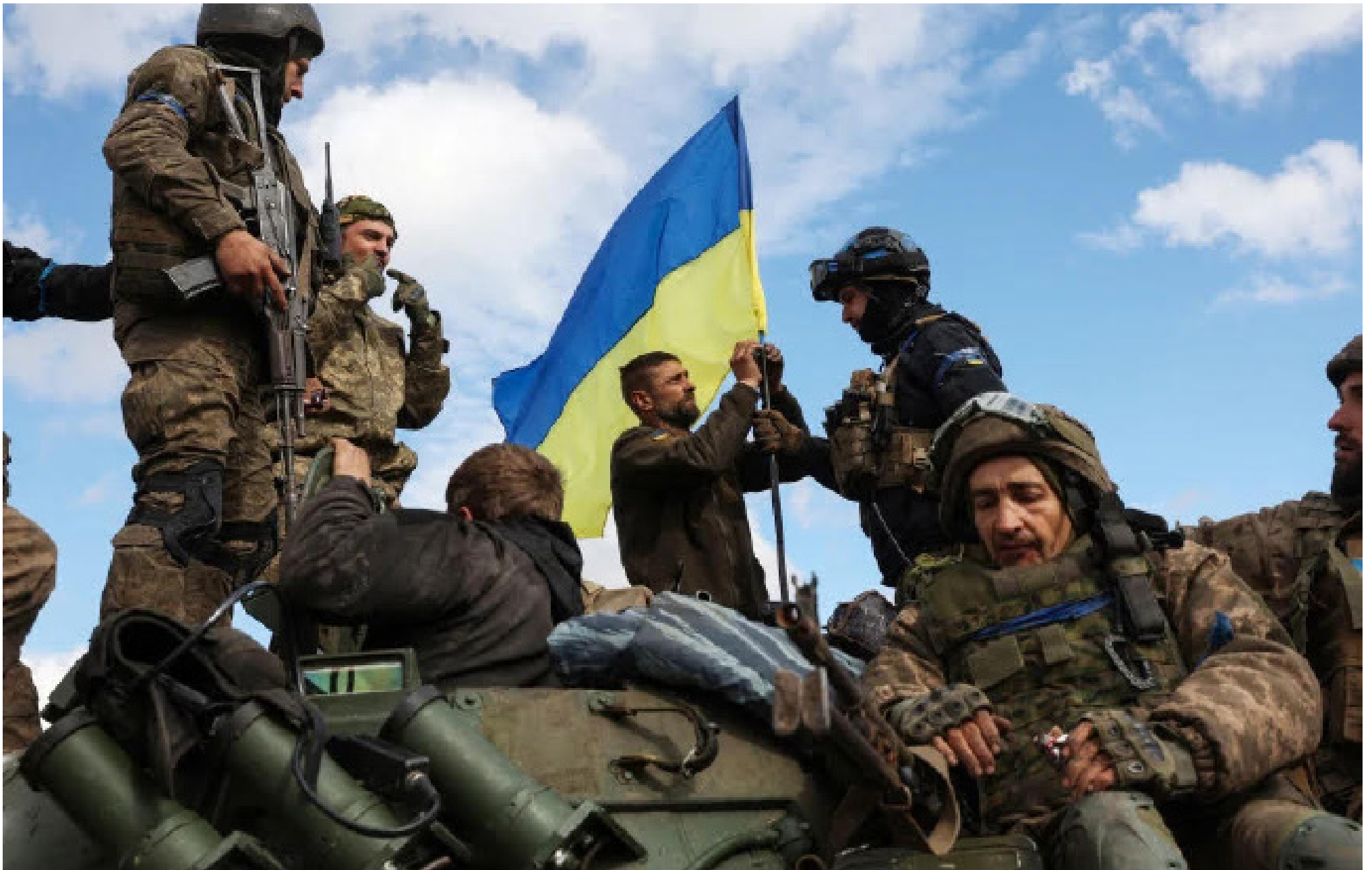
Ukrainian soldiers near Lyman, a key city in the eastern Donetsk region that Russian forces abandoned over the weekend to avoid encirclement.