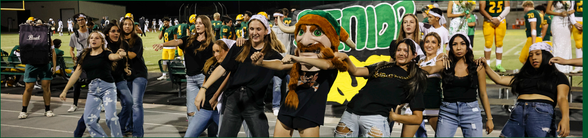
Junior Class; 90's; 3rd place